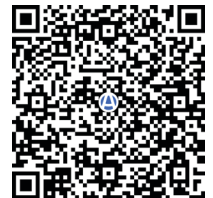
Scan QR Code

For more information call (337) 422-1803.